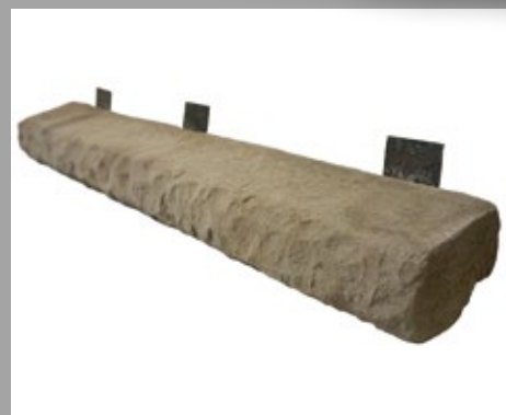
30" Top Sill Comes in grey and brown to accent the stone