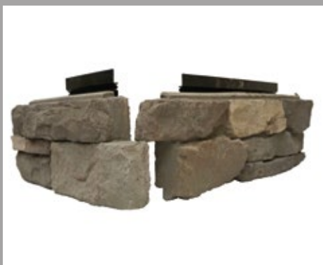
2 Piece Corner System Each corner set consists of a long and short end that works together like locking fingers