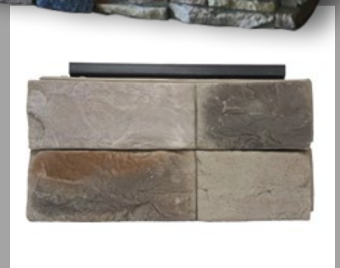
Easy-to-Install Panel Each panel is 5" x 20" and installs with screws